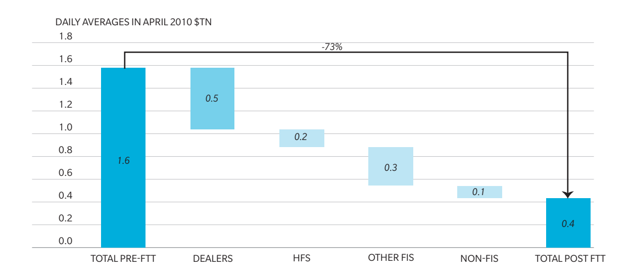
FIGURE 1: POST FTT RELOCATION AND REDUCTION OF AVERAGE DAILY VOLUME OF FX PRODUCTS BY COUNTERPARTY TYPE (EUROPEAN TAX ZONE)

Source: BIS, Oliver Wyman proprietary analysis NB detailed results in Appendix