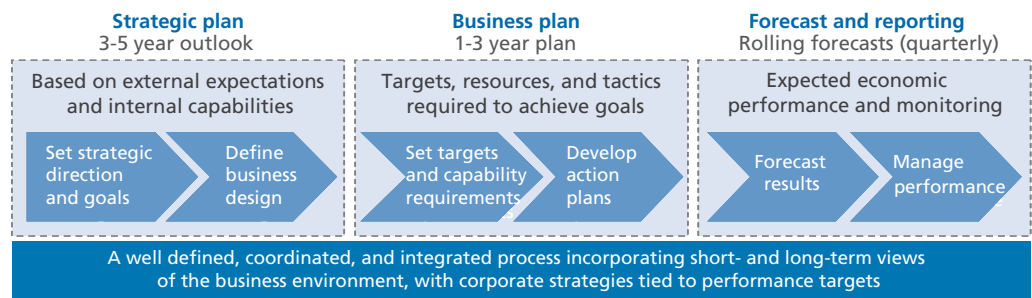
Exhibit 4 Enterprise performance management

EPM is successful when development time has been devoted to both planning and reporting. Planning processes are focused, integrated, and streamlined, defining the tactics and targets required to meet business objectives. Reporting focuses on volatile and material changes in measures (exception based) and tracks goals, key success factors, and drivers of the business.